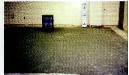
"Before" and "after" photographs of the cleanup project at Oulton's Business College in Moncton, New Brunswick.