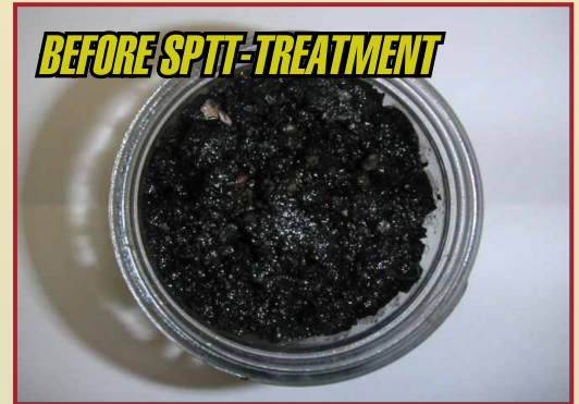
Mineral Oil & Grease – 40,580 ppm