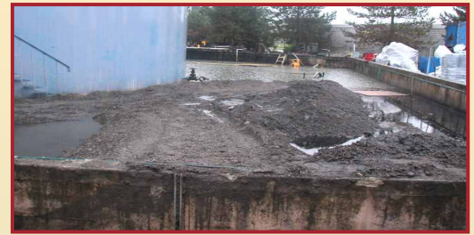
Refinery Site - Soil Contamination Clean-up Objective: < 3% Mineral Oil & Grease