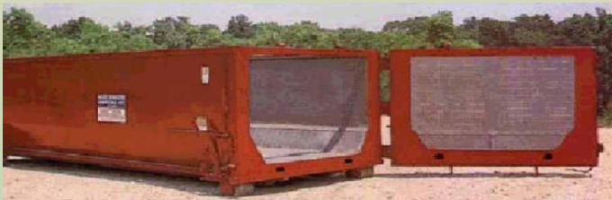
Small To Large Scale LNAPL & DNAPL Soil Remediation {Mobile 3 to 35 cubic yards units}