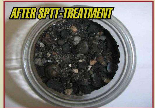
Post Treatment – 4200 ppm 90% Reduction To <0.4% Mineral Oil & Grease

“ I was looking at a $100,000 + bill . . . and the Insurance Company wasn't prepared to cover it. Ivey stepped in and used their Ivey-sol (SPTT) technology ... they succeeded in less time and at a fraction of the cost. It was like a breath of fresh air to learn of their new technology. ”